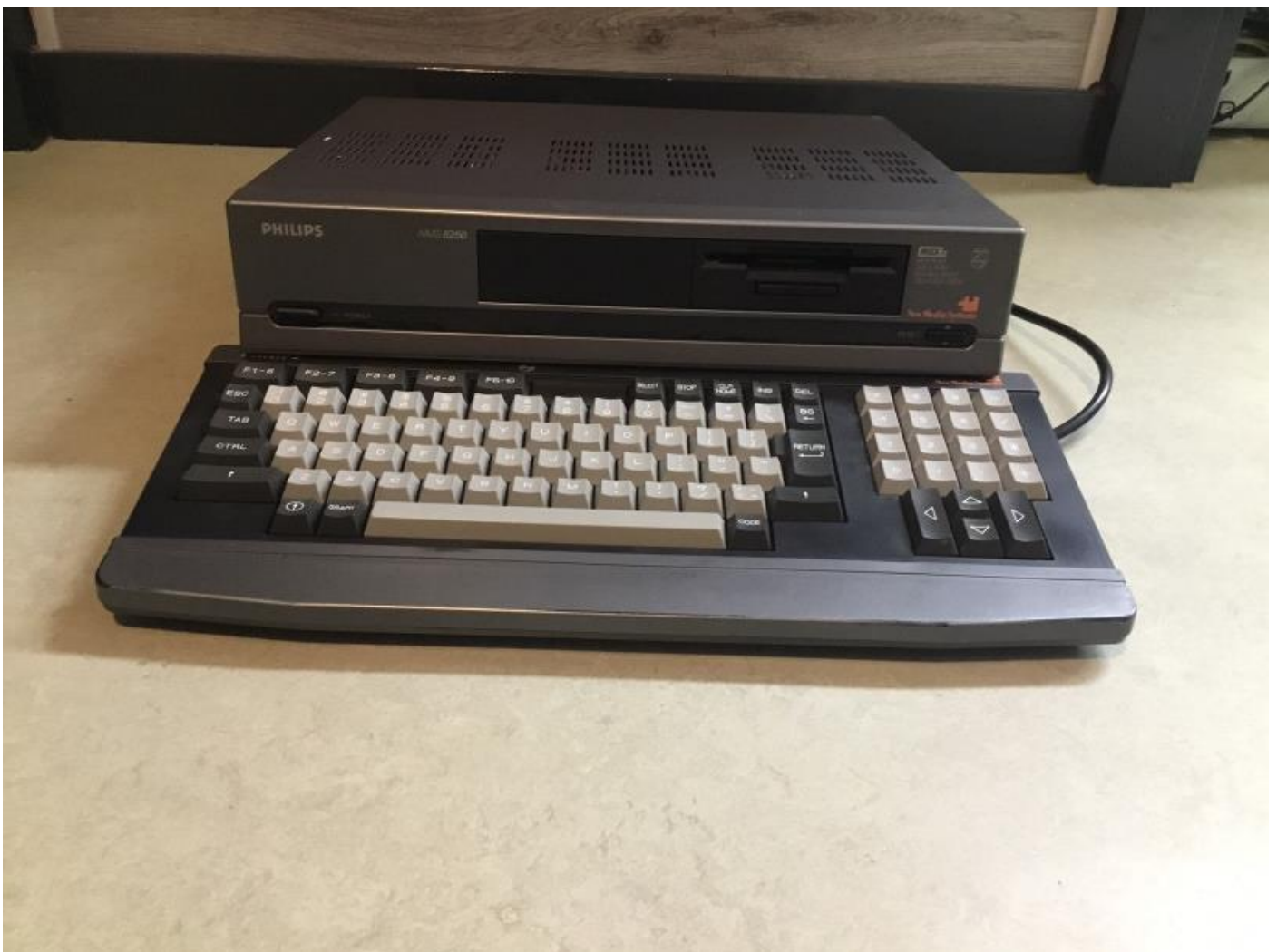
The Philips NMS 8250 MSX-2 computer.